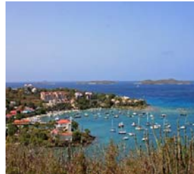
View of Battery and Cruz Bay from North Shore Road

In 1825 the Danish government opened a new courthouse and prison in Cruz Bay. The structure was intended to improve the treatment of slaves on St. John, by making justice a government issue rather than leaving it to individual planters. This building is now known as the Battery and is one of the only buildings remaining from the Danish Colonial period.